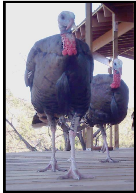
Turkeys make themselves at home at Indian Creek Ranch.