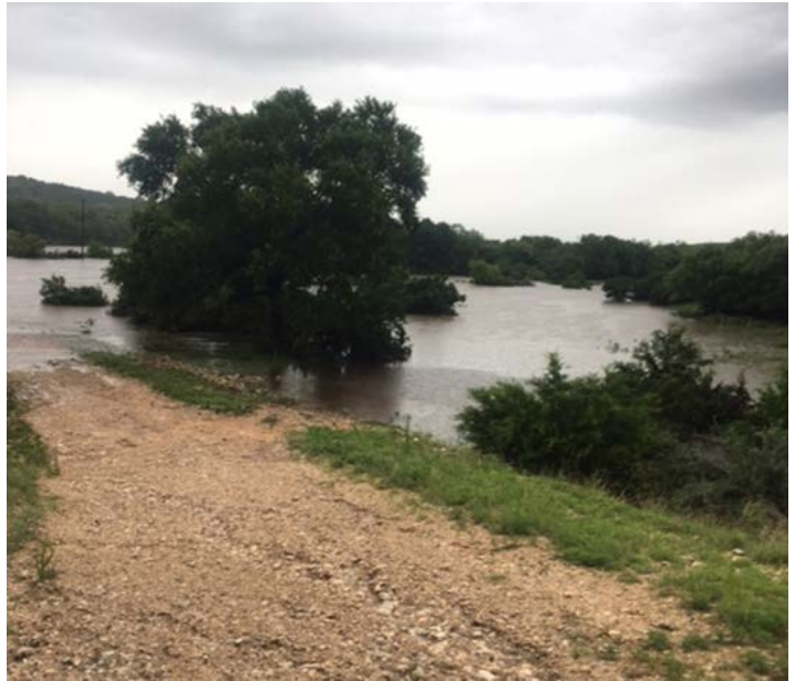
Cutting pen draw