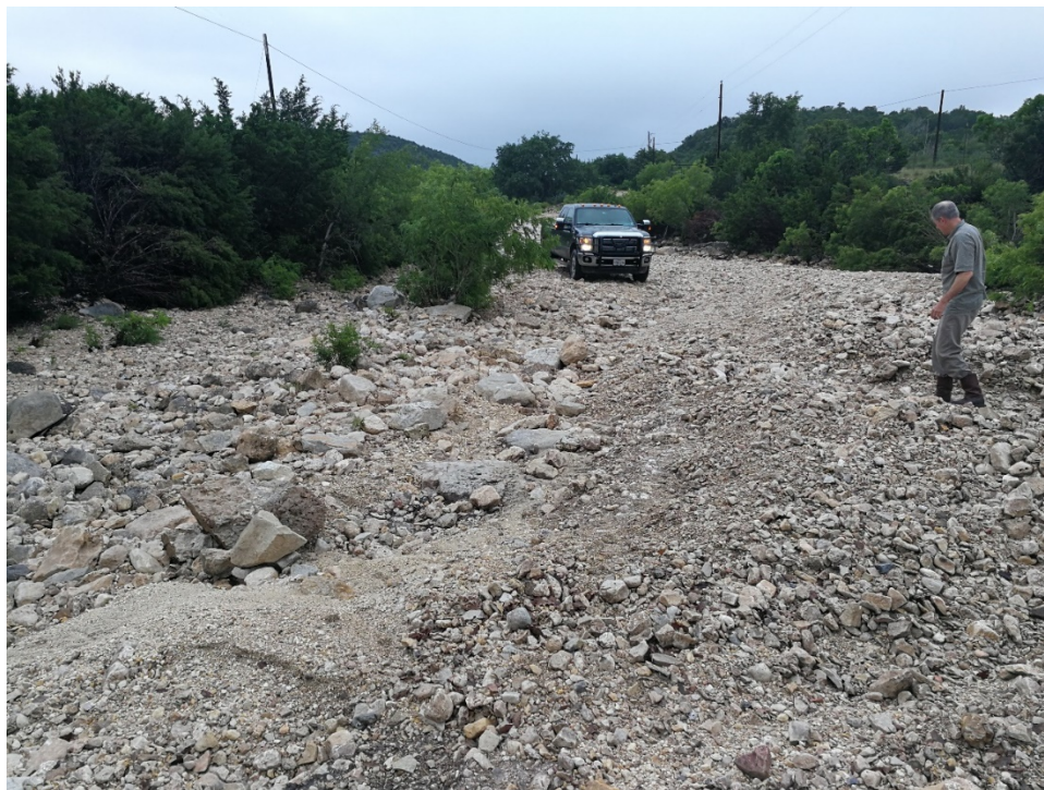
County road just before the Main Gate