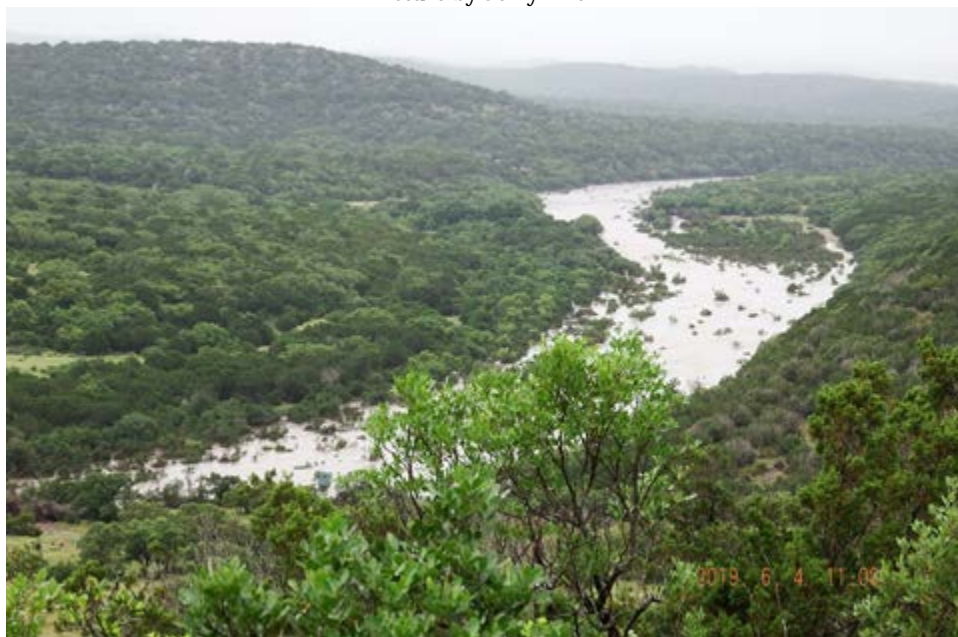
Indian Creek flowing towards the Airport