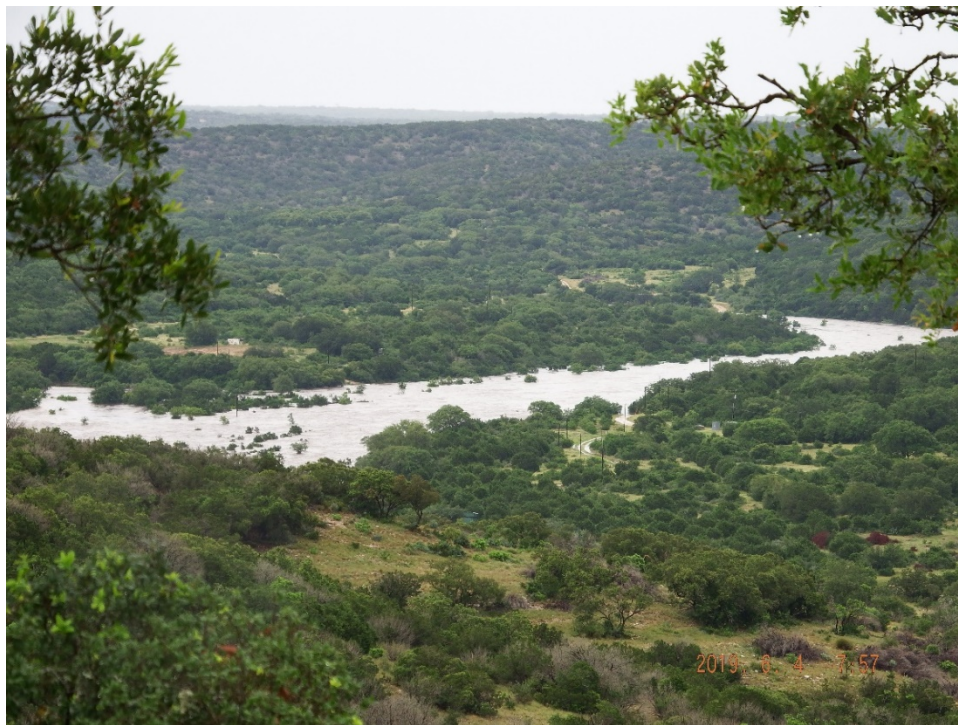
Arroyo near Phase III Well and three black tanks. Both ends of the road can be seen.