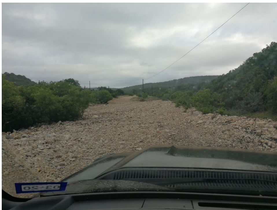
Our road just after the main gate Picture by Jerry Allen