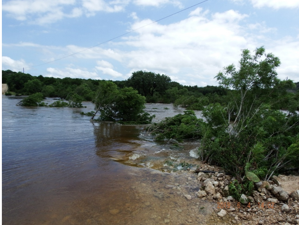
Indian Creek crossing near the Airport