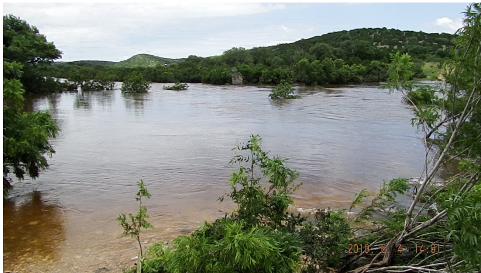
Road into Phase III near the Phase III Well. Two Arroyos join Indian Creek at this location.